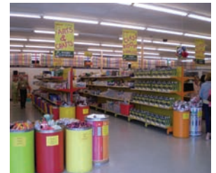
Teachers' Treasures is a Kids In Need Affiliate serving more than 8000 teachers in the Indianapolis area.

If you would like information about attending the 2010 Network Summit please contact us at 937-296-1230 or info@kinf.org .